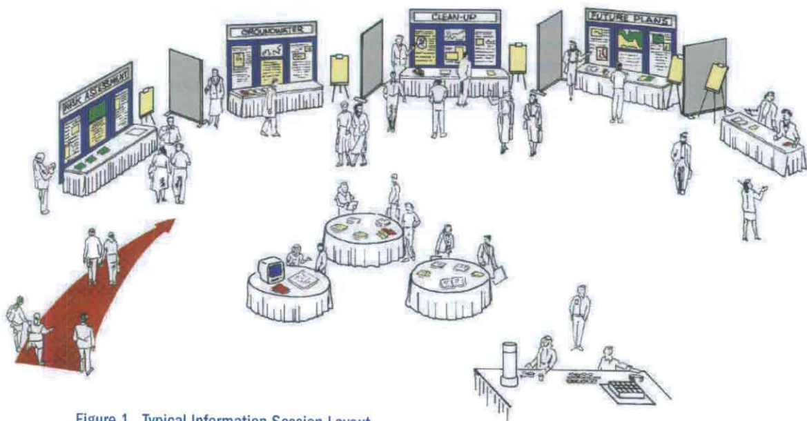
Figure 1. Typical Information Session Layout

If you have not received risk communication training, or need a refresher, please review the NEHC Risk Communication Primer before developing materials to present at your information session or selecting your 'subject matter experts' to man your displays. There is much to be considered and understood about message development, messenger selection and preparation before effectively providing information to the public or other concerned audiences. Please contact NEHC for more assistance or more information. NEHC is funded to provide risk communication support for issues concerning the Navy and Marine Corps Installation Restoration Program or Base Realignment and Closure sites.